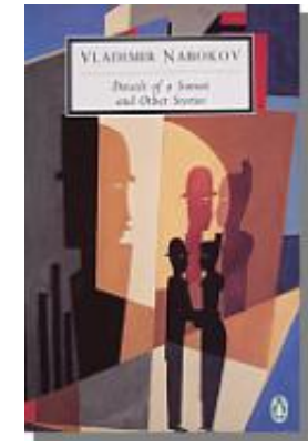
A48.4 First printing, 1994, cover, front

NABOKOV | \publisher's device\ PENGUIN BOOKS